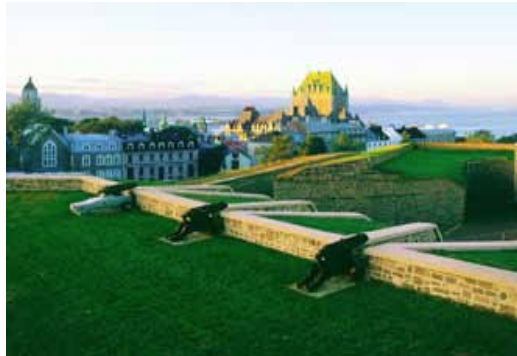
Quebec fortifications overlooking the Château Frontenac.

2012 Annual Meeting – Quebec City, Canada May 29 – June 3, 2012